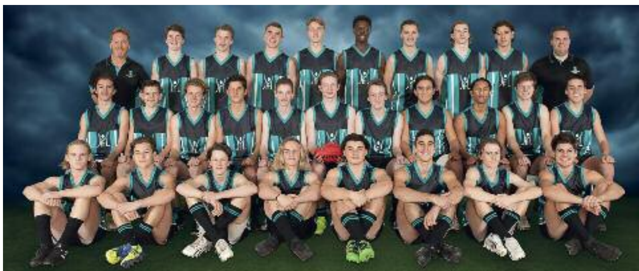
Under 15 Division 2