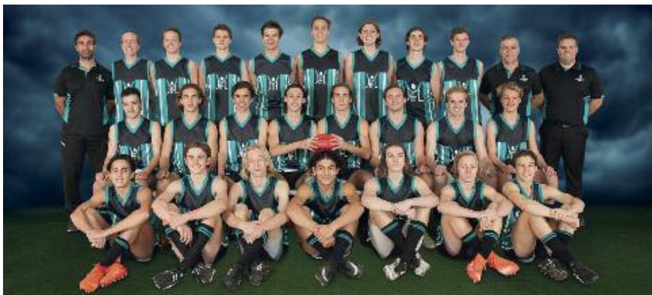
Under 15 Division 1