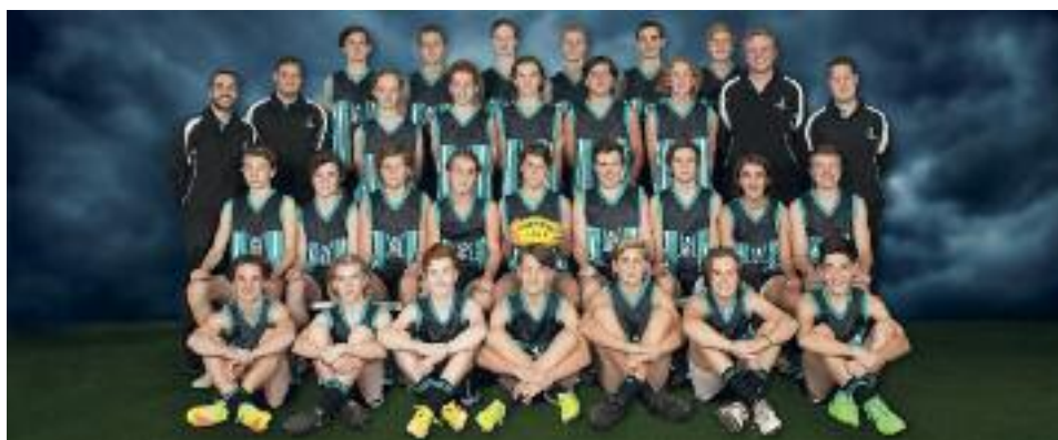
Under 14 Division 2