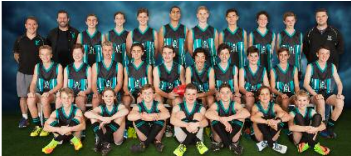
Yarra Junior Football League – Under 13 Black 2017