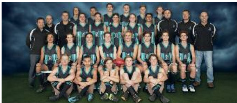
Under 14 Division 1