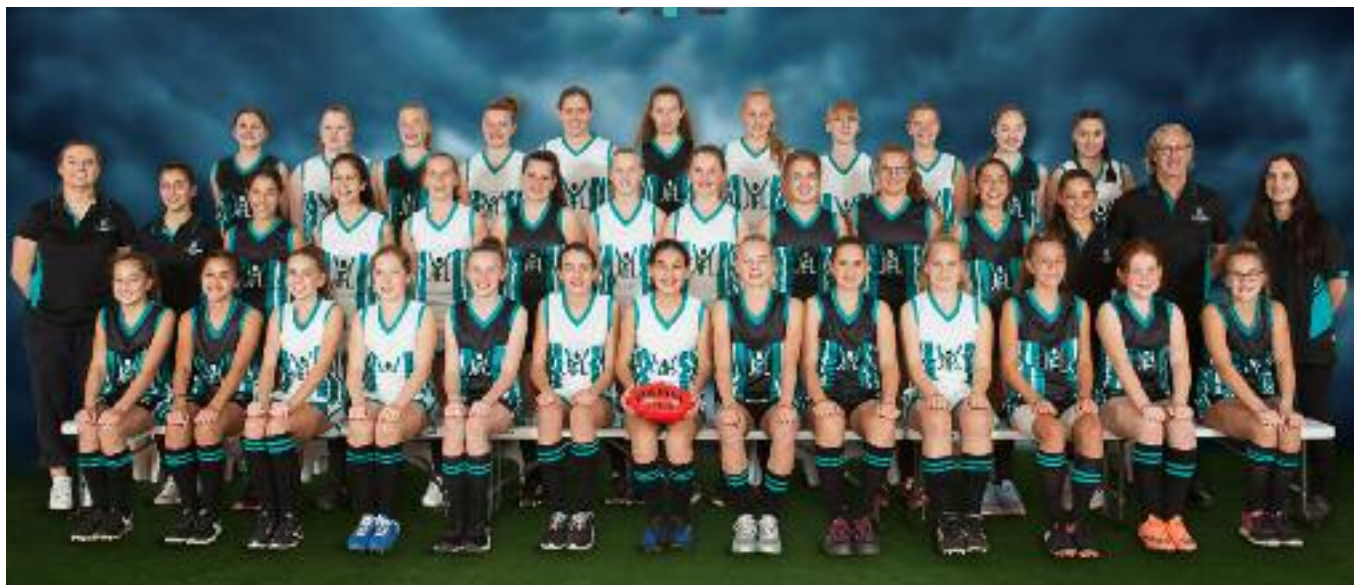
Yarra Junior Football League – Under 13 Girls 2017