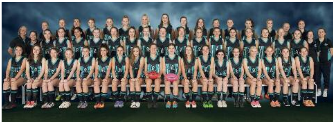
Under 15 Girls: (combined Teams 1 & 2)