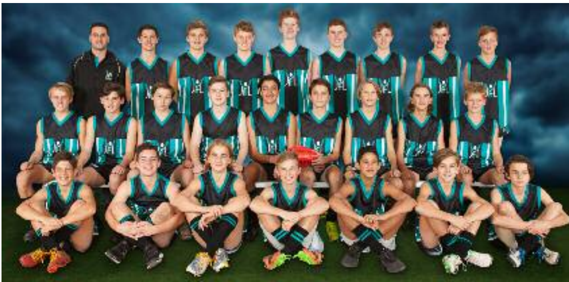
Yarra Junior Football League – Under 13 Teal 2017