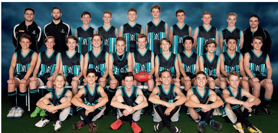
Under 13 Boys Division 1