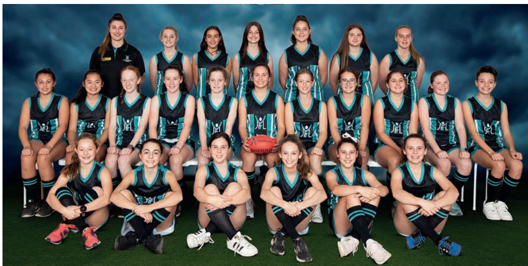
Under 13 Girls Division 2