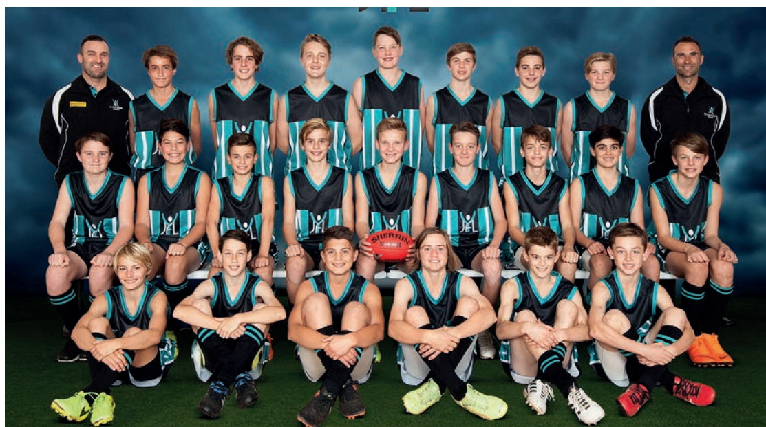
Under 13 Boys Division 2