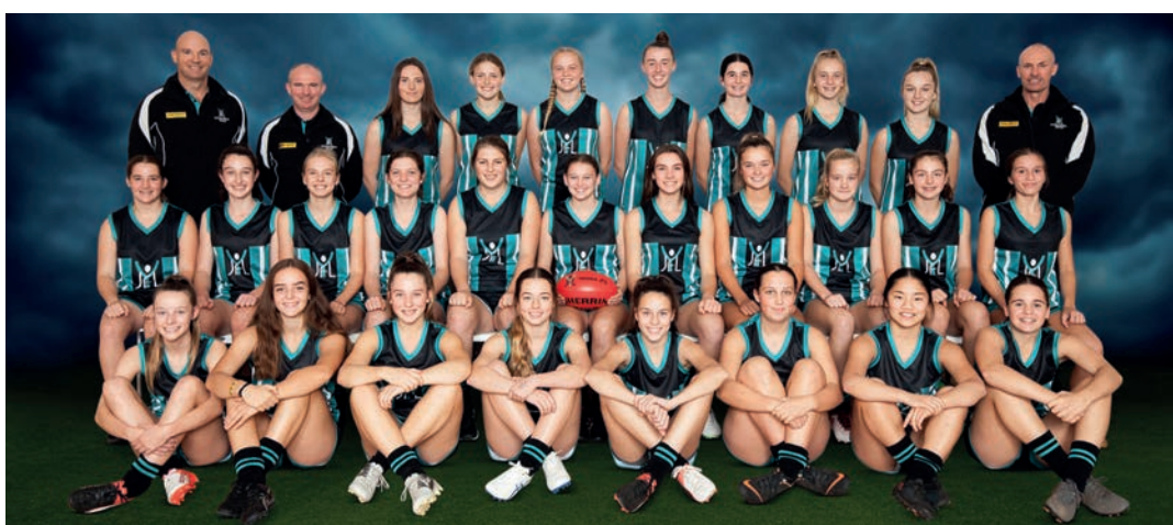
Under 15 Girls: Division 1