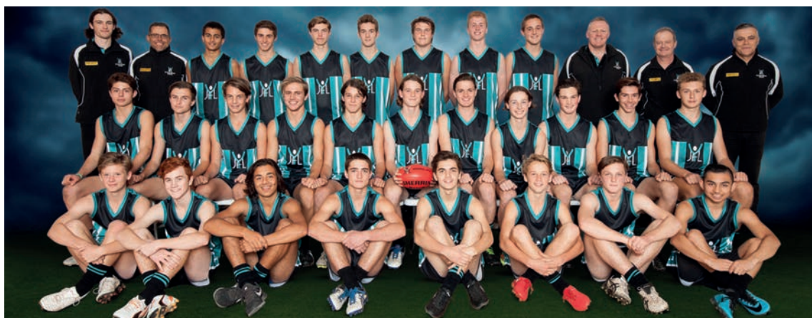
Under 15 Division 1