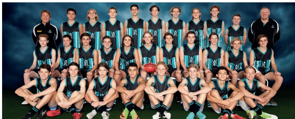
Under 15 Division 2