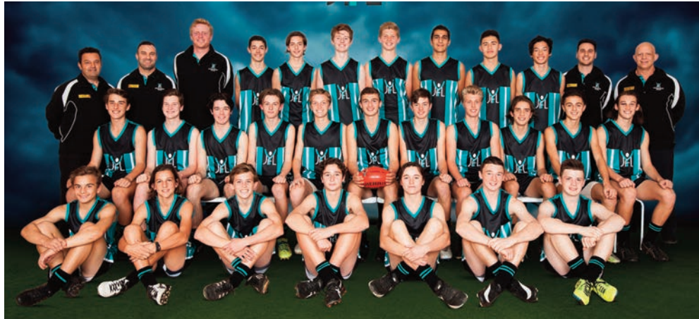
Under 14 Boys Division 1