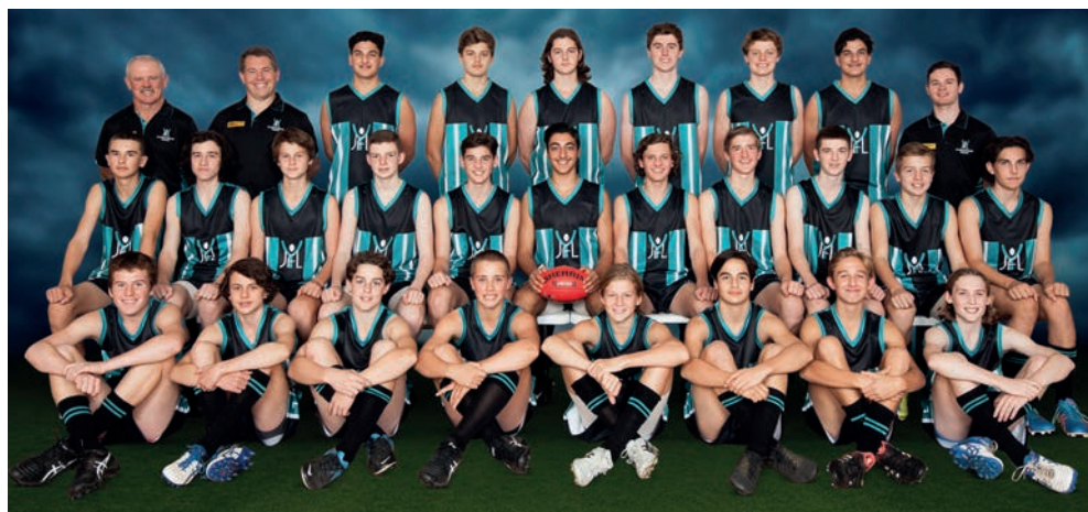
Under 14 Boys Division 2