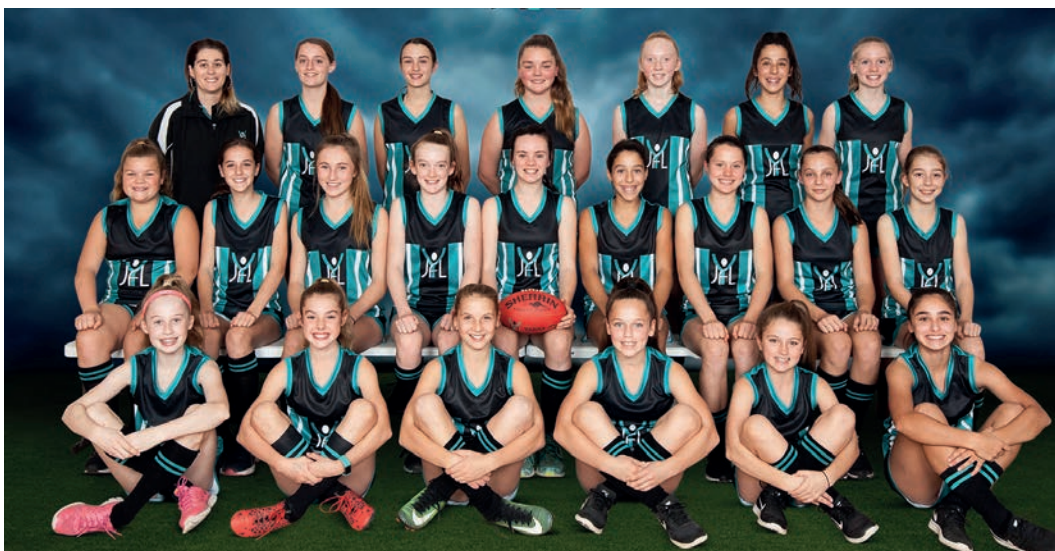
Under 13 Girls Division 1