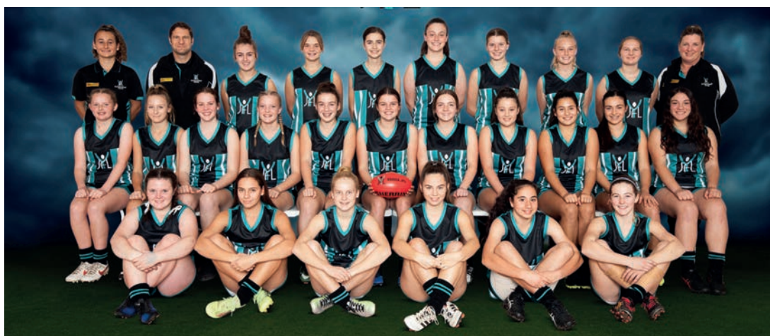
Under 15 Girls: Division 2